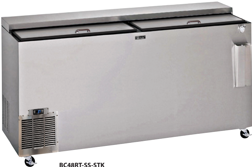
BC48RT-SS-STK Shown with with optional bottle opener and cap receiver