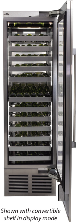
Shown with convertible shelf in display mode