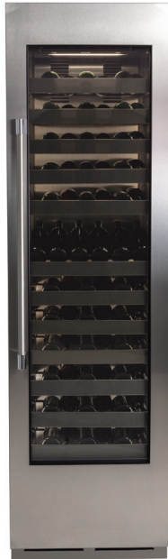
Shown with optional stainless steel door overlay panel