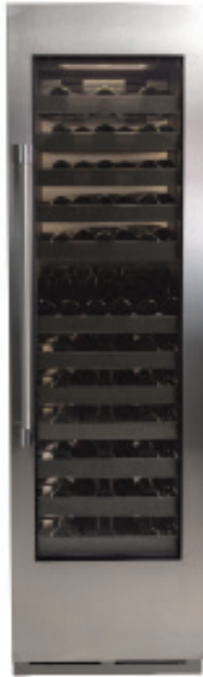
Shown with optional stainless steel door overlay panel