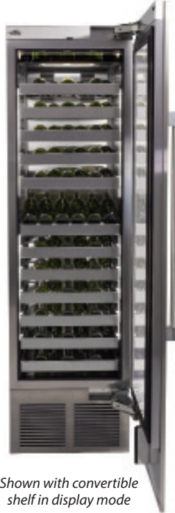
Shown with convertible shelf in display mode